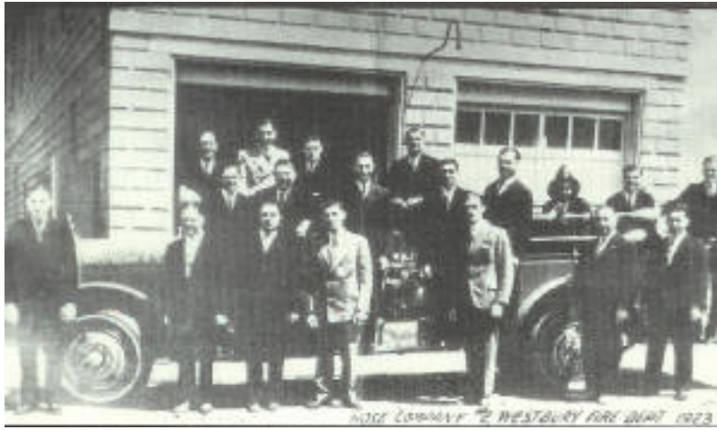
Members of Hose 2 in front of fire house (1923)